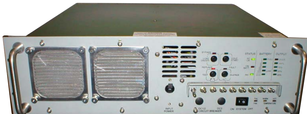
SP1250U-MPL, SP1500U-MPL, SP2000U-MPL & SP2400U-MPL

The SP U-MPL Series and the Outpost™ Series batteries are designed for outdoor use and will operate in extreme temperature environments of 0°C to +60°C (32°F to +122°F).